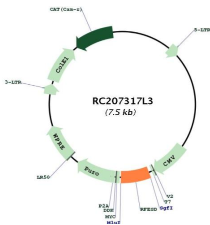
Circular map for RC207317L3