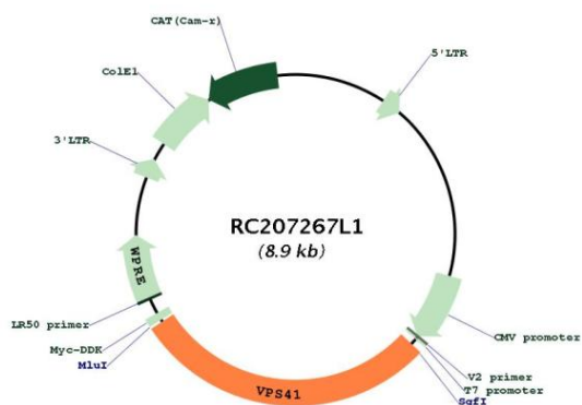
Circular map for RC207267L1