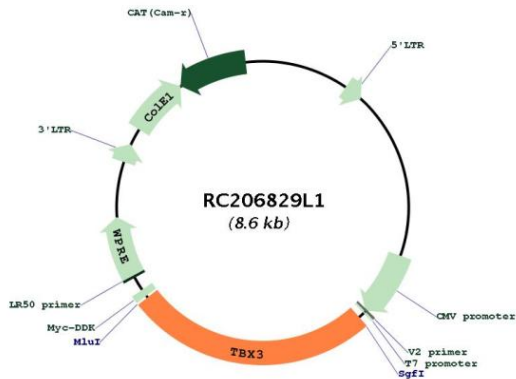
Circular map for RC206829L1