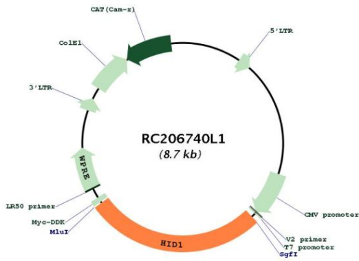
Circular map for RC206740L1