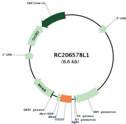
Circular map for RC206578L1