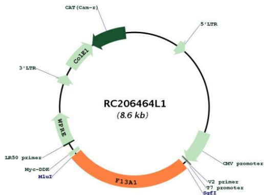
Circular map for RC206464L1