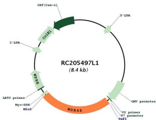
Circular map for RC205497L1