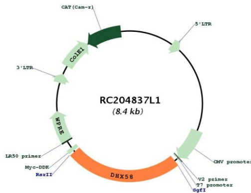
Circular map for RC204837L1