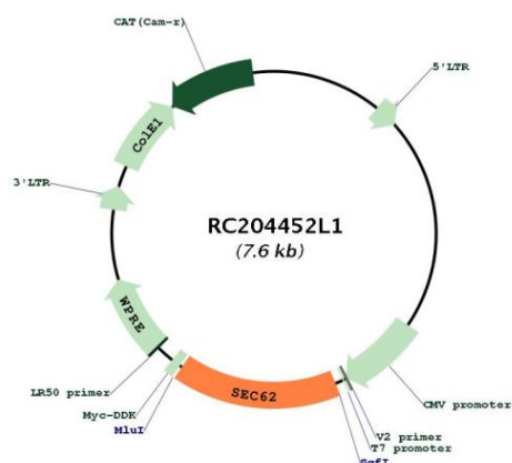
Circular map for RC204452L1