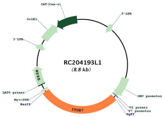
Circular map for RC204193L1