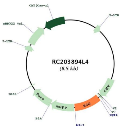
Circular map for RC203894L4