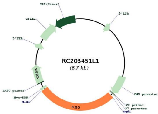
Circular map for RC203451L1