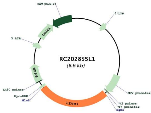
Circular map for RC202855L1