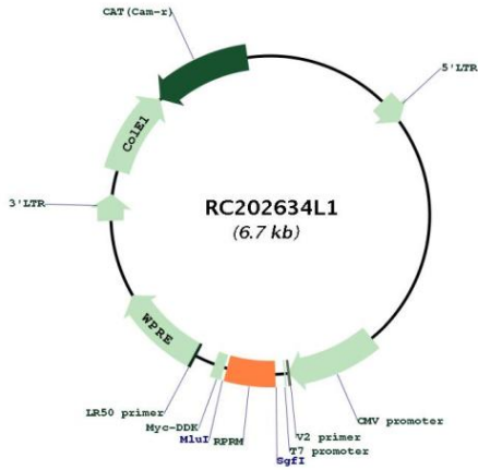
Circular map for RC202634L1