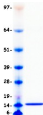
Coomassie blue staining of purified CCL2 protein (Cat# [TP302180]). The protein was produced from HEK293T cells transfected with CCL2 cDNA clone (Cat# RC202180) using MegaTran 2.0 (Cat# [TT210002]).