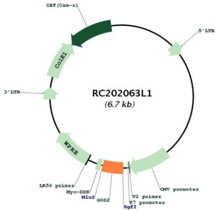
Circular map for RC202063L1