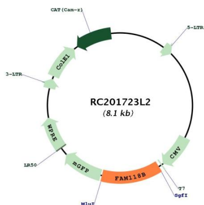
Circular map for RC201723L2