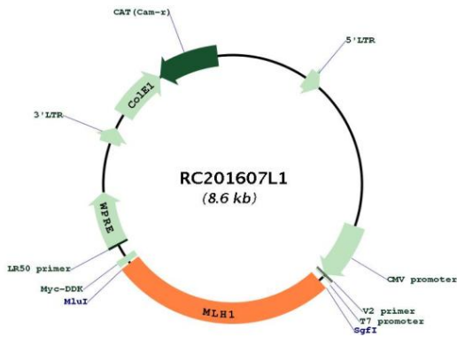
Circular map for RC201607L1