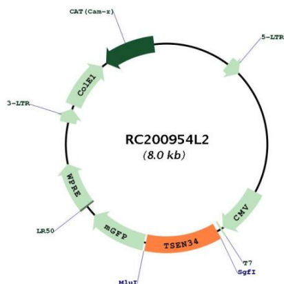
Circular map for RC200954L2