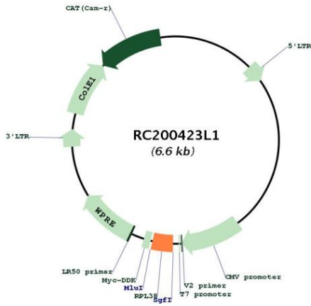
Circular map for RC200423L1