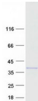
Coomassie blue staining of purified DBNDD2 protein (Cat# [TP300076]). The protein was produced from HEK293T cells transfected with DBNDD2 cDNA clone (Cat# RC200076) using MegaTran 2.0 (Cat# [TT210002]).