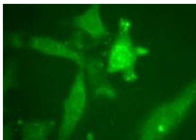
Bmi1 staining in Hela cells.