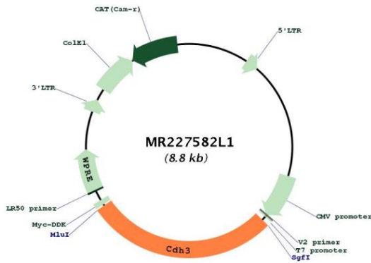
Circular map for MR227582L1