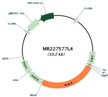
Circular map for MR227577L4