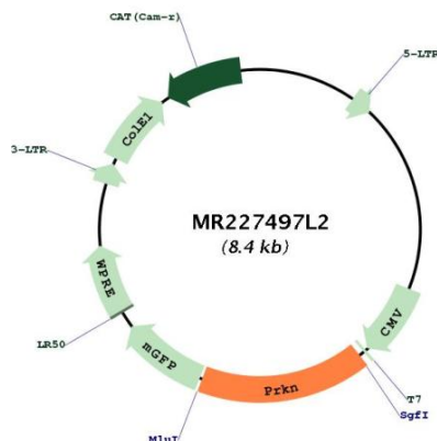
Circular map for MR227497L2