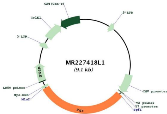
Circular map for MR227418L1