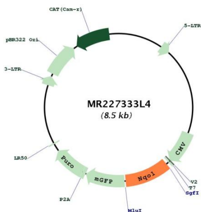
Circular map for MR227333L4