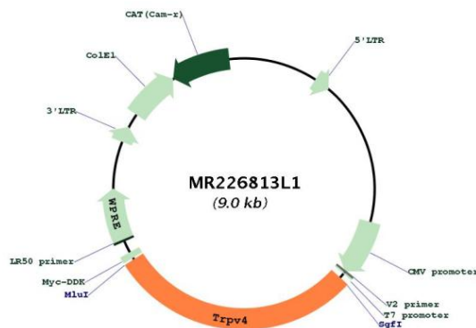
Circular map for MR226813L1