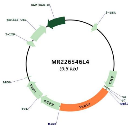
Circular map for MR226546L4