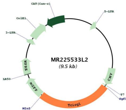
Circular map for MR225533L2