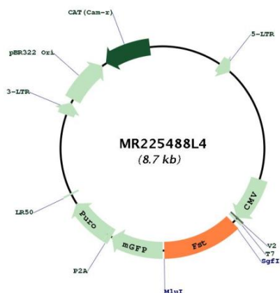
Circular map for MR225488L4