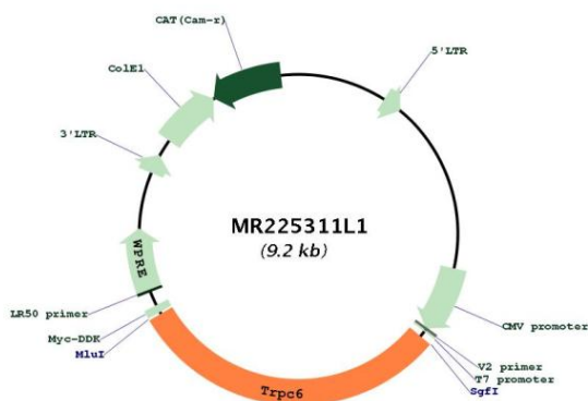
Circular map for MR225311L1