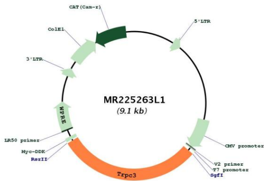
Circular map for MR225263L1