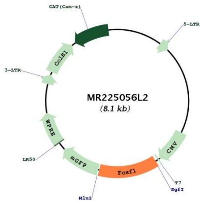
Circular map for MR225056L2