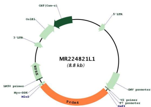
Circular map for MR224821L1