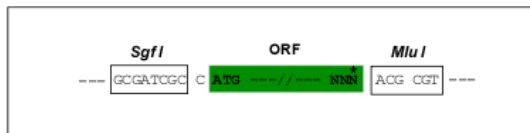
Cloning sites used for ORF Shuttling: