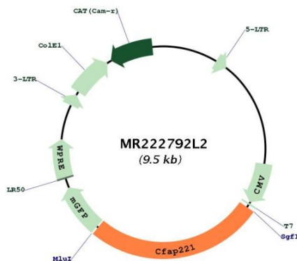
Circular map for MR222792L2