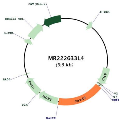
Circular map for MR222633L4