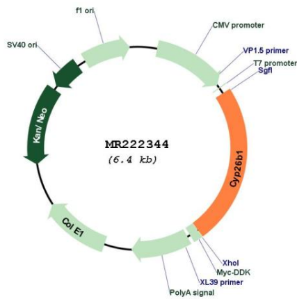
Circular map for MR222344