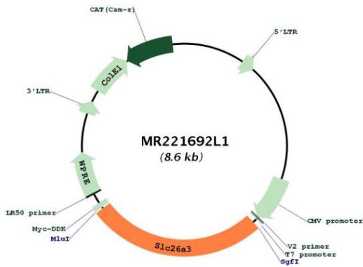
Circular map for MR221692L1