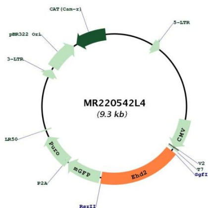
Circular map for MR220542L4