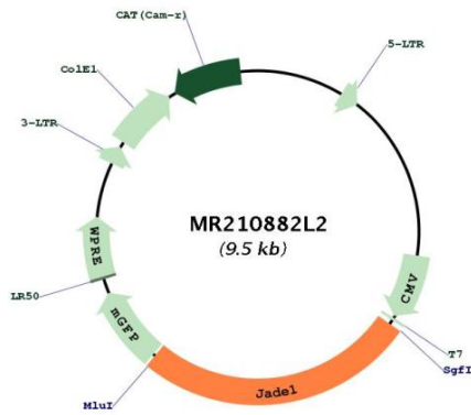
Circular map for MR210882L2