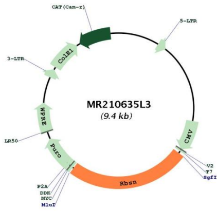
Circular map for MR210635L3