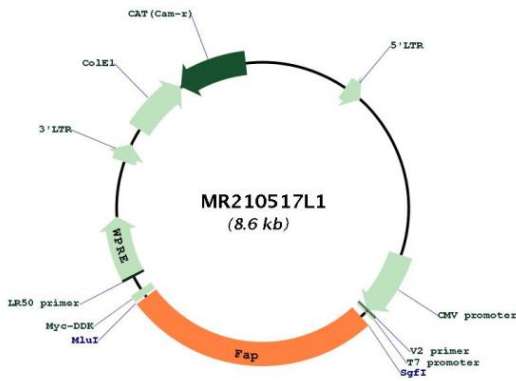
Circular map for MR210517L1