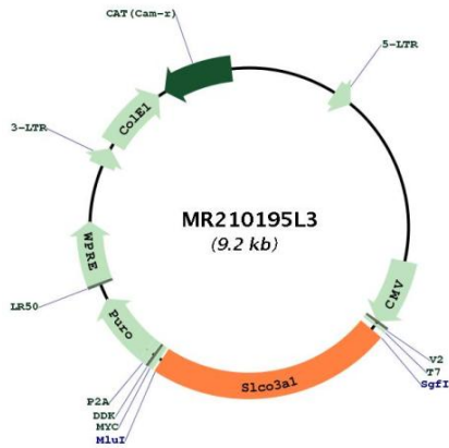
Circular map for MR210195L3