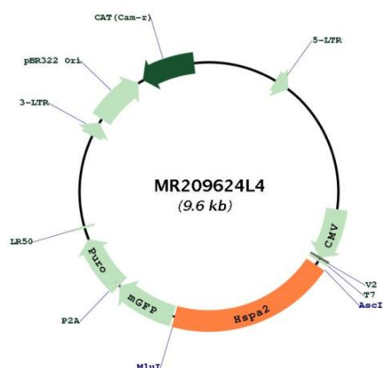
Circular map for MR209624L4