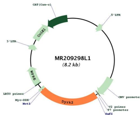
Circular map for MR209298L1