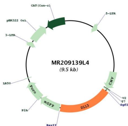
Circular map for MR209139L4