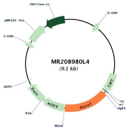
Circular map for MR208980L4