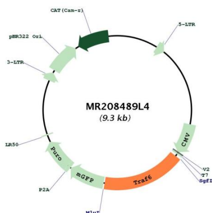
Circular map for MR208489L4